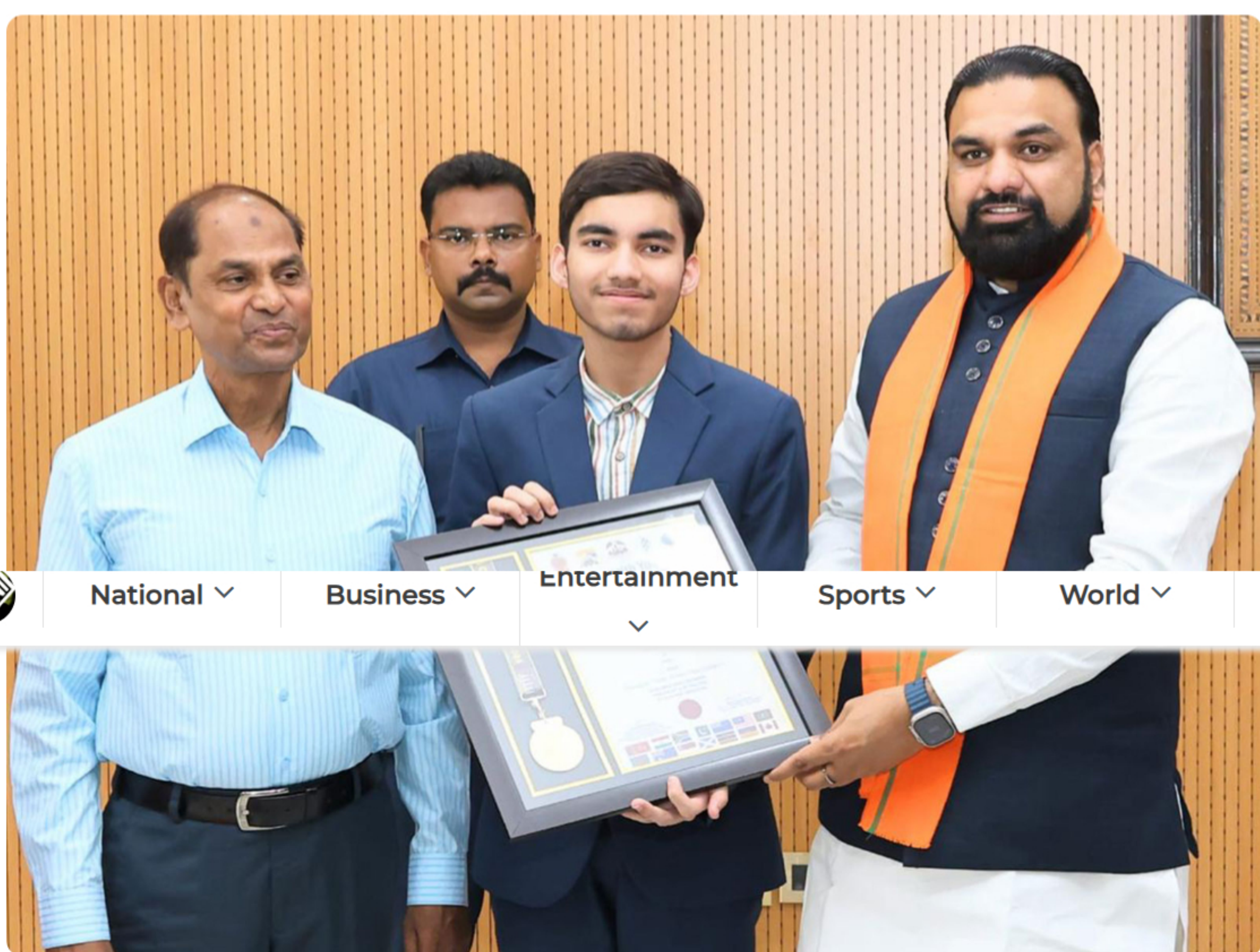
Bihar Chief Minister Samrat Choudhary (R). (Photo: GD Goenka)